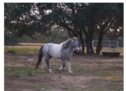
Out for a stroll