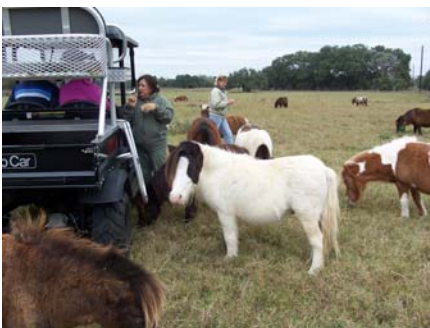
I know there's cookies in there!

"There is something about the outside of a horse that is good for the inside of a man"